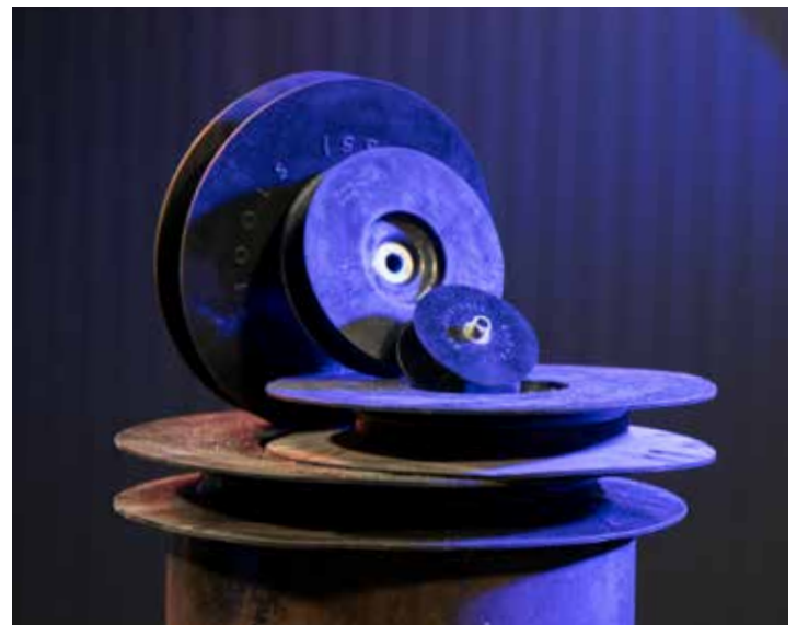
Pipe purge sealing disc