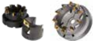
Tooling (from p. 32)