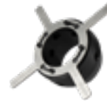
Special tool for elbow beveling