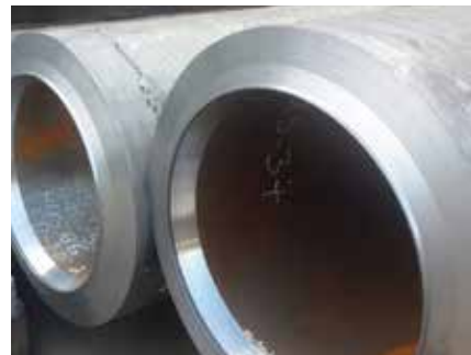
Bevel shape compound