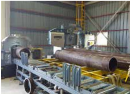
Pipe Cutting & Beveling line