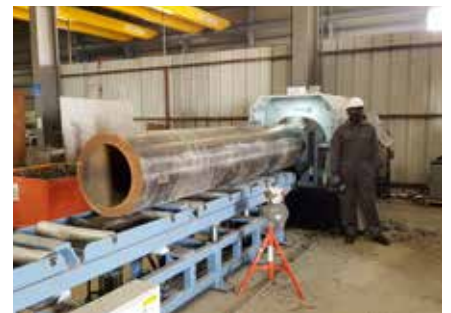
Independent production line