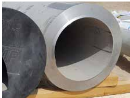
Preparation of pipes up to 120"