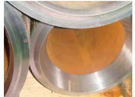
Pipe material nine-crome, 750 mm OD