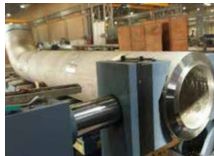
J-Bevel shape and many other beveling shapes